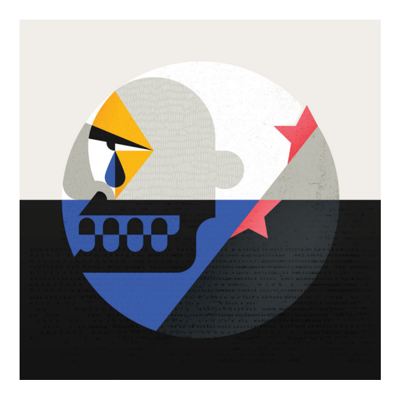
Illustration Botond Vörös