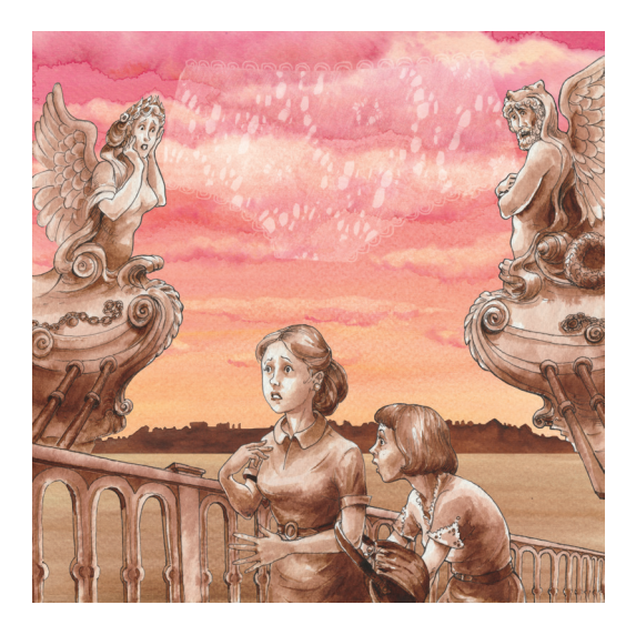
Illustration Fatime Germán