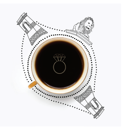
Illustration Mária Csenge Olajos