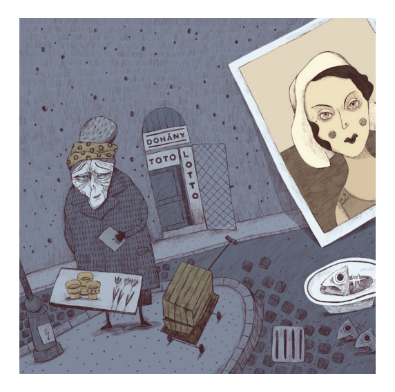
Illustration Kornél Rátkai