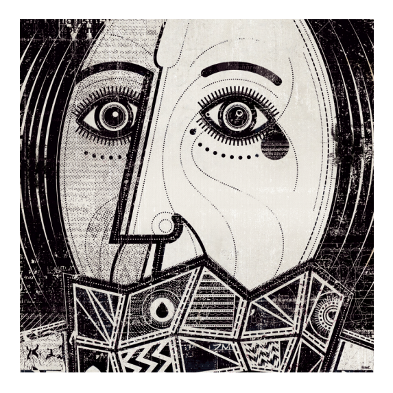
Illustration László Herbszt