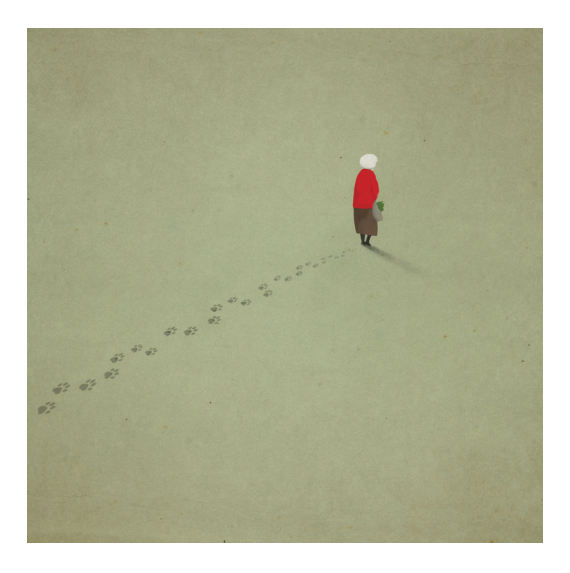
Illustration Emőke Holbis