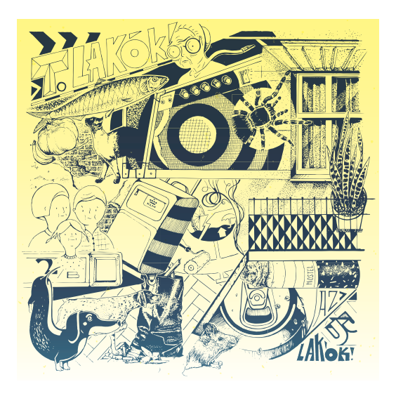
Illustration Balázs Tóth