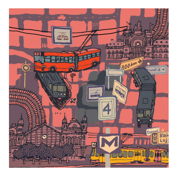
Illustration Attila Stark