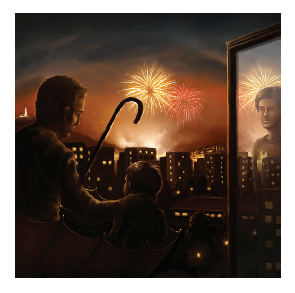
Illustration Levente Farkas